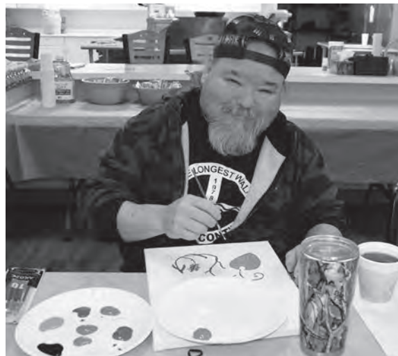
Participants sketched designs on the canvas before deciding on paint colors and picking up their brushes.