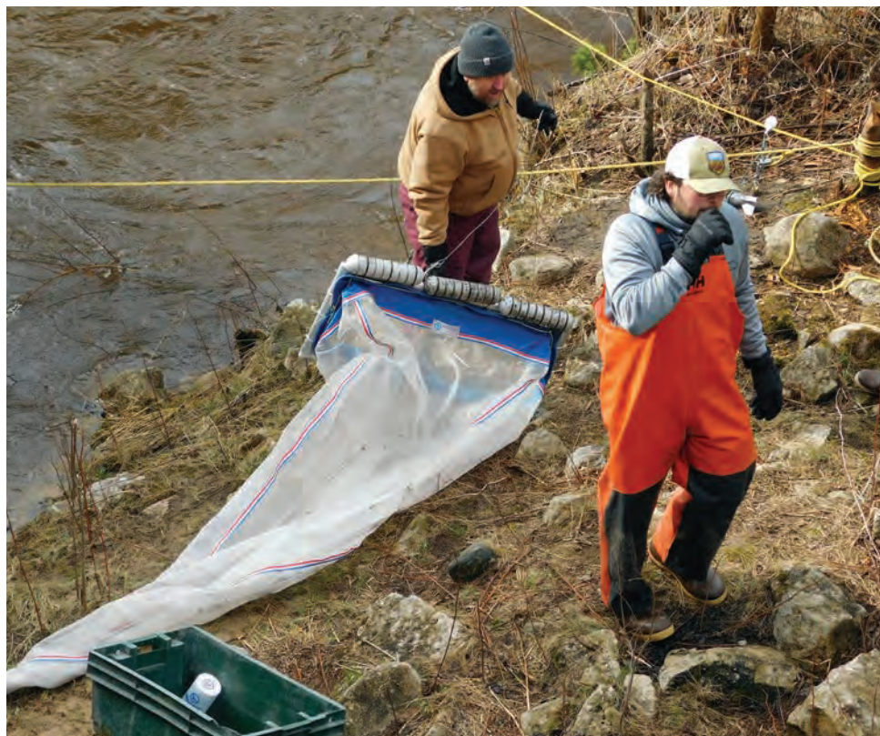
Preparing to launch the seine net into the Carp River.

The nearby bridge allowed researchers to easily get their ropes across the river.