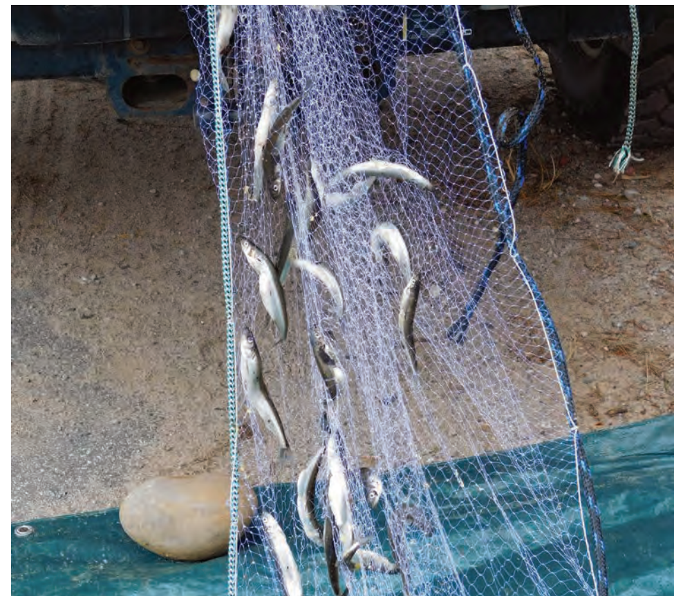
The fine mesh of the gill nets provided a bountiful harvest requiring a team of helpers, carefully placed tarps and a little bit of muscle power. The parking lot at Bay Mills Community College, with Lake Superior in the background, proved to be the ideal location for separating the smelt from the long net.