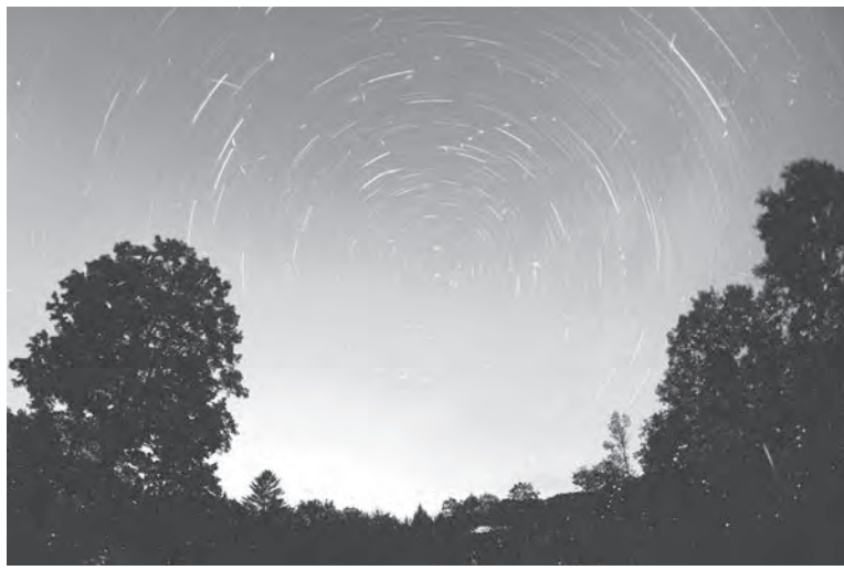
A real-time representation of time.

These colonial narratives are based on settler time, an important part of the Chi-mookomaan worldview. When we restrict our historical lens to just the past few hundred years, the stories of this continent’s violent and lawless colonial periods can feel as distant as stories from Greek mythology. Settler time casts a “spell” by fooling the colonizer community into believing that they have a lot of history here on Turtle Island. It tricks them into thinking that before they arrived, this place was a vast, unpopulated wilderness. Settler time conditions colonizers into believing