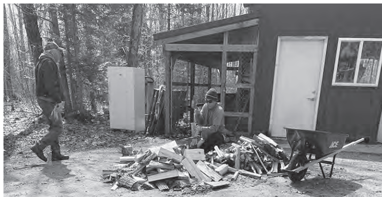
Firekeepers split and pile firewood for the sacred fires. Below, a feast for the fasters, after completing their fasts, is held.