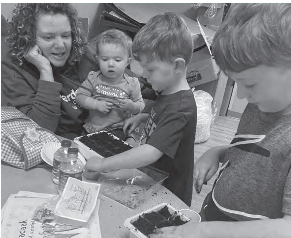
The Kaminski family.