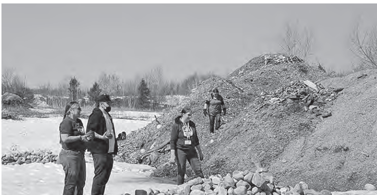
Preparing for this year's fasting and releasing camp Traditional Medicine and volunteers collect sweat lodge rocks and below, break up snow.

Newberry Powwow Aug. 12 at Newberry Powwow Grounds, 4935 Zee Ba Tik Lane. Grand Entry: 1 p.m. Feast: 5 p.m. Bring a dish to pass. Open to public. No drugs, alcohol or dogs. For info and vendors, call Nicole Maudrie at (906) 293-8181 or Barb Sharp at (906) 287-1951.