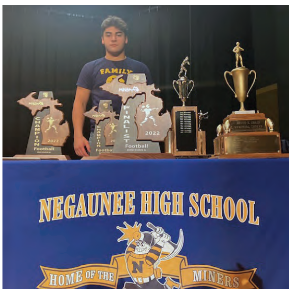
With a host of accolades under his belt, this Negaunee High School graduate will be moving to the gridiron looking to take the field for the Northern Michigan University Wildcats when play begins in the Superior Dome.