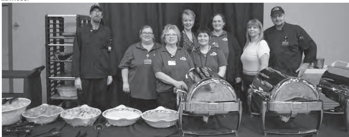
Kitchen and Banquet staff who worked at the event preparing and serving the luncheon. You can view all of the photos from the event by doing a Facebook search for: Photos from Sault Tribe News Archives .