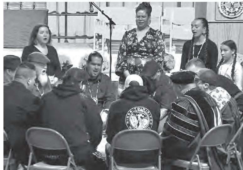
Munising's Giizhep Nimki Da'awigaan (Morning Thunder Drum) at Northern Michigan University's spring commencement.

The Sault Ste. Marie Tribe of Chippewa Indians Grand Island Band has lived in these lands since