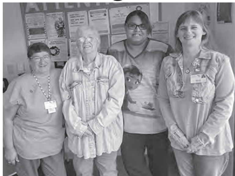
Above, Newberry Health Center. Below, Sault Health Center medical team.