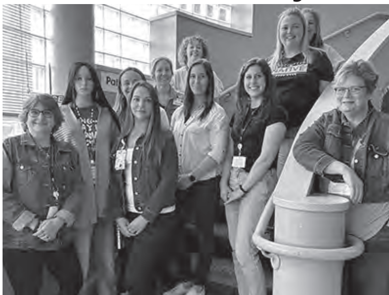
Above, Community Health. Below, Advocacy Resource Center.

Winners of the Denim Day Competition were awarded $100 pizza gift card for their efforts. Individuals were treated to a $25 pizza gift card. ARC would like to thank everyone for participating in the now-annual event. Witnessing people coming together for such a good cause is such a wonderful feeling. Chi Miigwech on behalf of ARC.