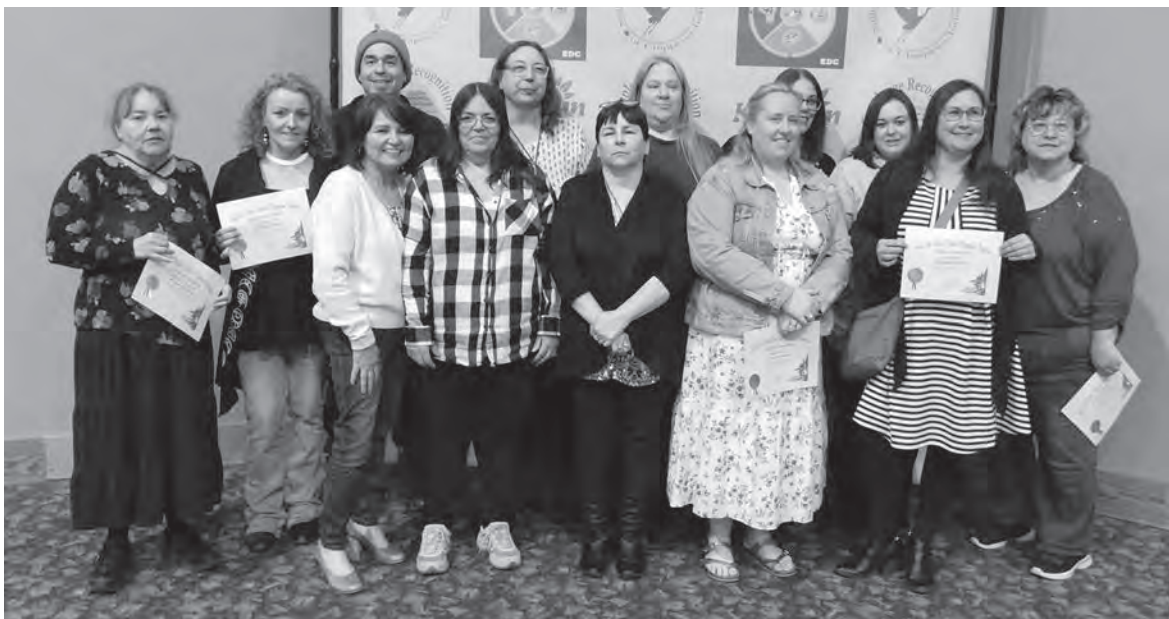
Anishnaabek Community and Family Services staff that attended the luncheon.