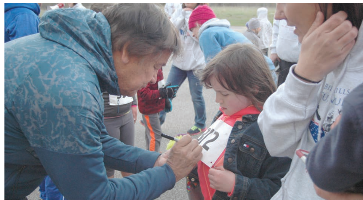
Above left, Billy Mills autographs the runner's bib for one of the young racers. Above left, a racer in the grandmaster category begins her run in the 5K race.