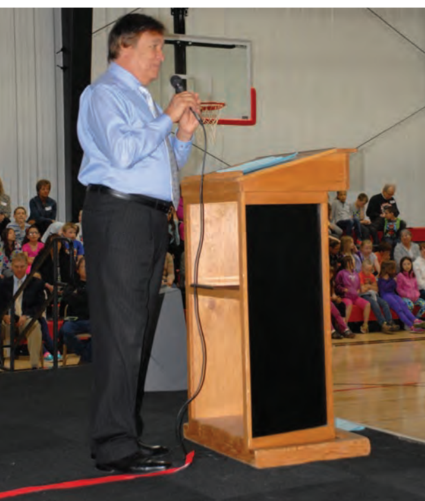
Billy Mills addresses the students at JKL Bahweting School. (See story on page 17).