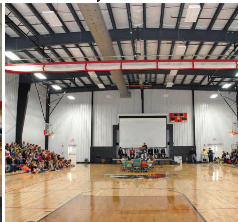
JKL's new gymnasium.