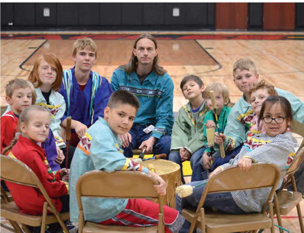
Ogimaa-minisinoos, the JKL Bahweting School drum, played during the opening ceremony of Billy Mills' visit and ribbon cutting ceremony for the new gym.

The event was sponsored by JKL Bahweting Public School Academy.