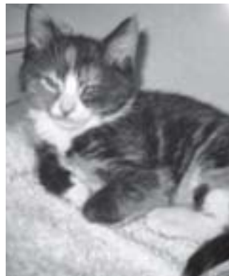
Baby Calico Penny.

Open Monday – Saturday, 9 a.m to 1 p.m., Sunday 9-11 a.m. or Call for an Appointment.