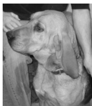
Liza is a 5 year old girl she is very sweet and loves to sing and cuddle.