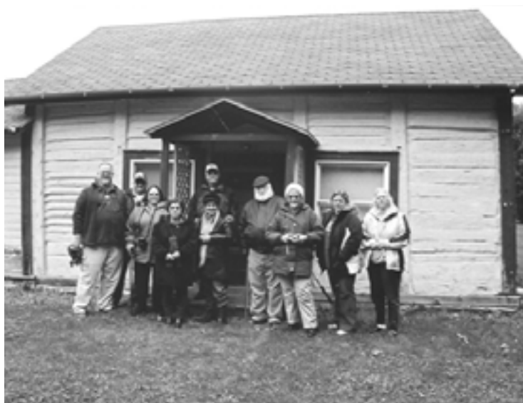
Davenport descendants visit old homestead

According to Frazier, some of the descendants were meeting for the first time. Other family roots on the island include the McGulpin, Duffina,