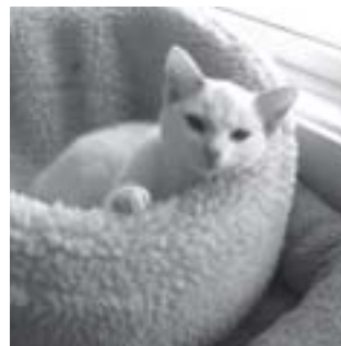
Beth is sweet little beauty.