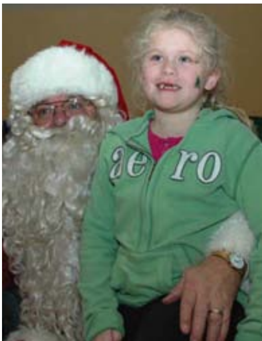
Happy to see Santa, this little girl had no problem smiling for the cameras.