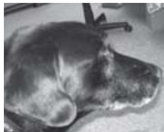
Doc loves everyone, people, dogs and cats, and a nice spot by the fireside.