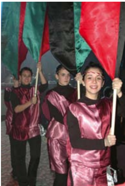
As a Madrigal dinner at the Kewadin Casino and Convention Center drew to a close, pennant bearers made their exit.