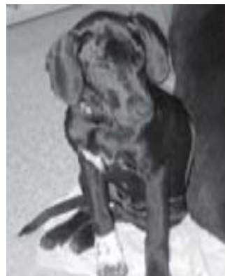
Merry is a smart puppy, and is very calm and sweet.