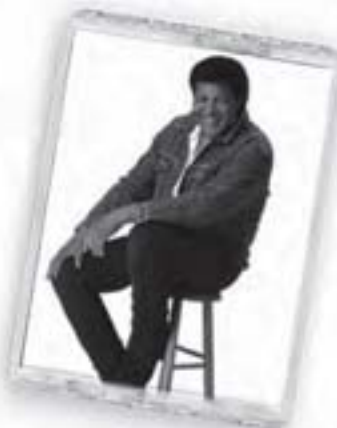
Blake Shelton Saturday, January 30th Sault Ste. Marie, Michigan