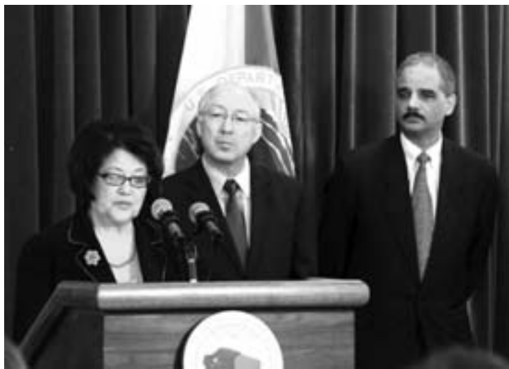
Elouise Cobell speaks in Washington, D.C., after the agreement of the 13-year-old law suit as Department of the Interior Secretary Ken Salazar and Attorney General of the United States Eric Holder look on.

The Native American Rights Fund also notes the assets involved in this suit are not government handouts, but money that belongs to individual Indians. Most of this money has been generated from the sale or lease of natural resources on allotted Indian lands. This lawsuit addresses the government's longstanding