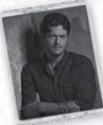
Chubby Checker Saturday, January 16th Sault Ste. Marie, Michigan