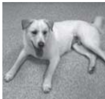
Claus is an 8-month-old puppy who loves everyone.