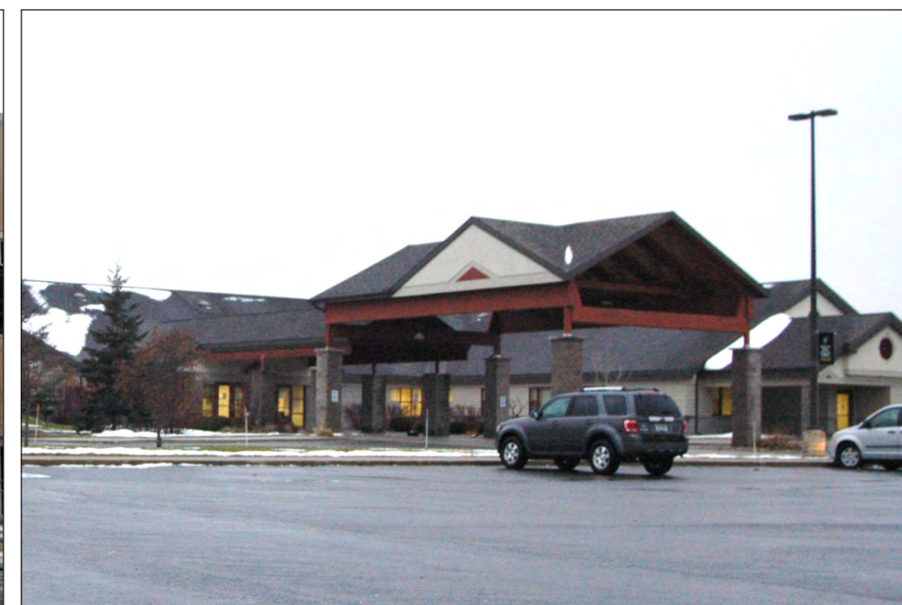
MANISTIQUE TRIBAL COMMUNITY CENTER IN MANSITIQUE, MICH.