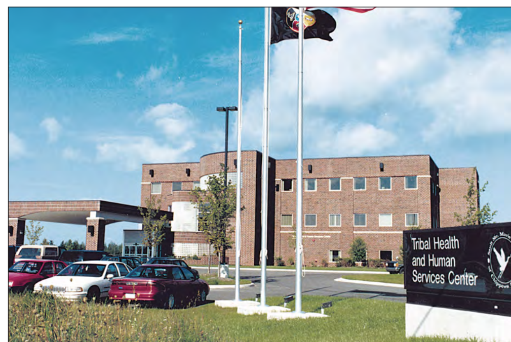
TRIBAL HEALTH AND HUMAN SERVICES CENTER IN SAULT STE. MARIE, MICH.