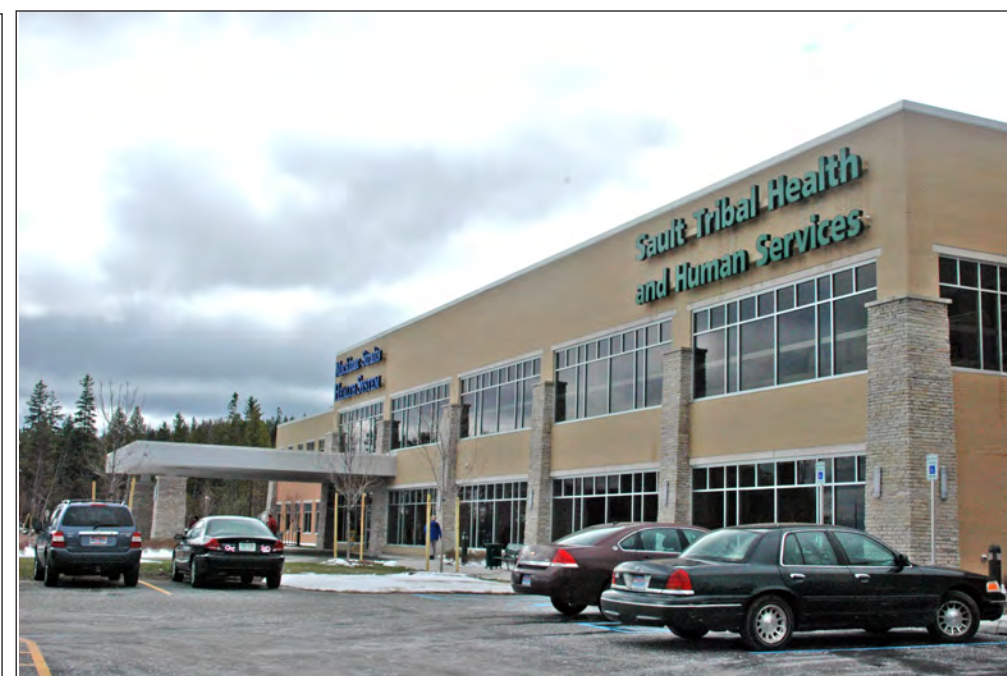
TRIBAL HEALTH AND HUMAN SERVICES IN ST. IGNACE, MICH.