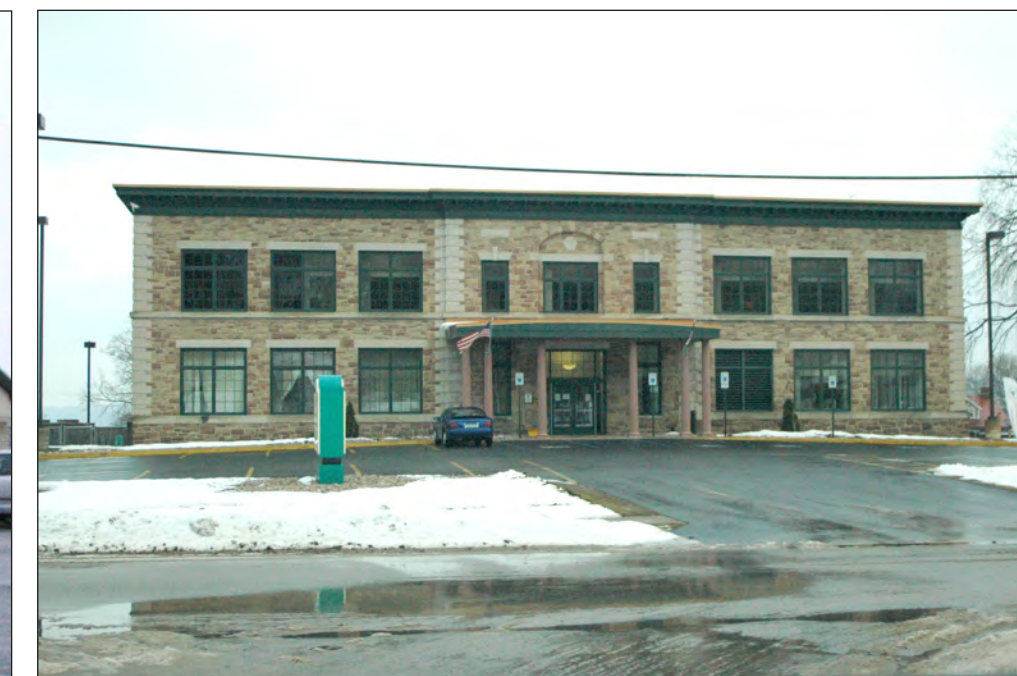
GRAND ISLAND TRIBAL COMMUNITY CENTER IN MUNISING, MICH.