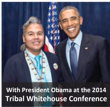
With President Obama at the 2014 Tribal Whitehouse Conference